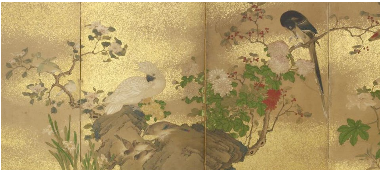
A section of an eight-fold paper screen painted in ink and colour on a buff and kinsunago (sprinkled gold) ground with kachoga (birds and flowers). Nagasaki school Japan 18th century Edo period