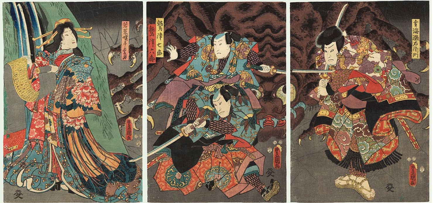
Toyokuni III/Kunisada (1786 - 1864) Japanese Woodblock Print Princess Wakana and Giant Spider, 1853